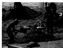
NJ.com Belmar Cam

Sandcastle builders have descended on Belmar this morning and you can catch a glimpse on NJ.com's live Belmar Cam. Building ends at noon and judging happens after that.