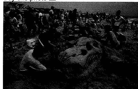
Tanya Breen / Gannett New Jersey

A group of castle creators build "Castle-saurus Rex" during the Annual New Jersey Sandcastle Contest in Belmar Wednesday.